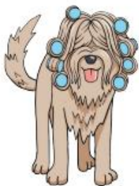
curl the fur