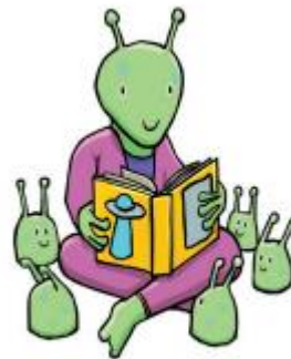
get near to hear

Lumen Learning Trust c/o Saxon Primary School, Briar Road, Shepperton TW17 0JB Limited Company Registered England No 08670599